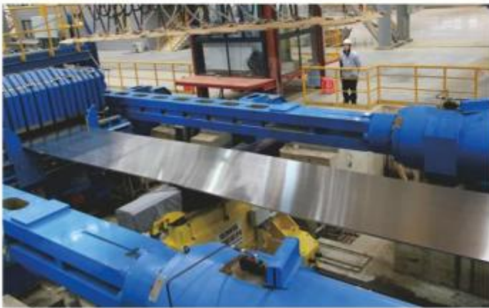
7050 Aluminium Stretched Plate