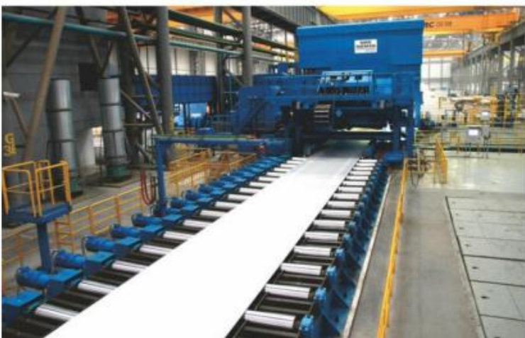
5083 Aluminium Hot Rolled sheet