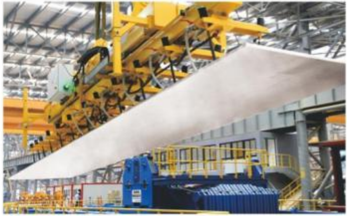
7075 Aluminium Quenched Plate